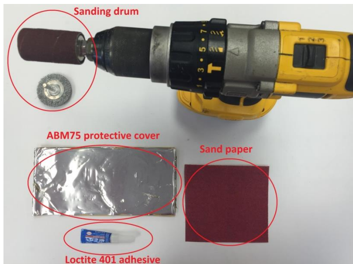
Figure 1: Tools required for installing SenSpot™ steel strain gauge

Typically, cold cured adhesive and ABM75 protective cover are provided by Resensys to the customer along with SenSpot™ steel strain gauge. Other items such as sanding drum and drill or sand paper and wiping tissues can be purchased from any local hardware store.