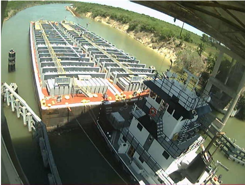
Figure 2: A typical picture taken by Resensys Wireless Solar Powered Camera indicating the field of view when there is a barge floating in close proximity of the fender/pier