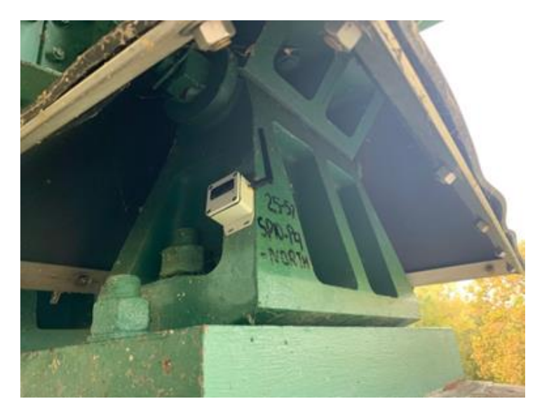
Tilt SenSpot sensor on bearing for bridge fracture critical monitoring

Resensys SenSpot sensors are easily placed/ installed on critical elements as determined by inspection, finite element modeling or authority's/client's suggestion. Since they are wireless, no additional wiring is required, and the sensors are mounted with adhesive or flange mounted depending on the application. A Senimax data acquisition unit is conveniently mounted nearby or conveniently mounted within 1.0Km (0.62miles) free space of the Senspot Sensors and a SenScope Module is installed on the client's/authority's laptop or PC.