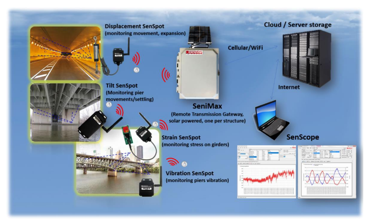
Illustration of Resensys SHM based on SenSpot sensors for fracture critical monitoring